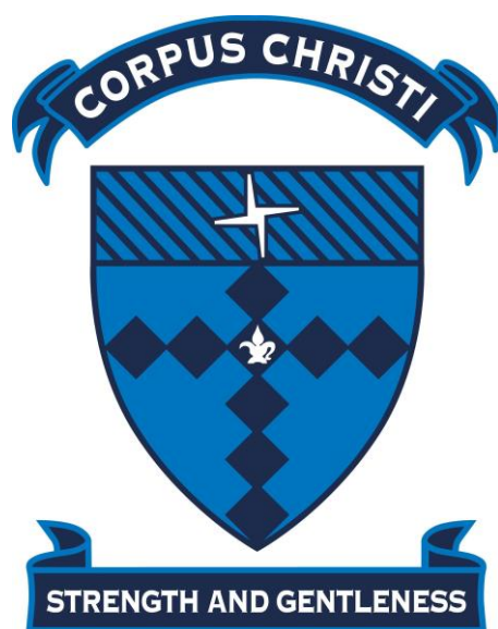
Corpus Christi School Crest

As disciples of Jesus and in partnership with our families, parish and the broader faith community, we work for the service of others, Encouraging a Commitment to Justice and a Call to Action